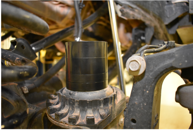
3" Bump Stop Configuration Pictured